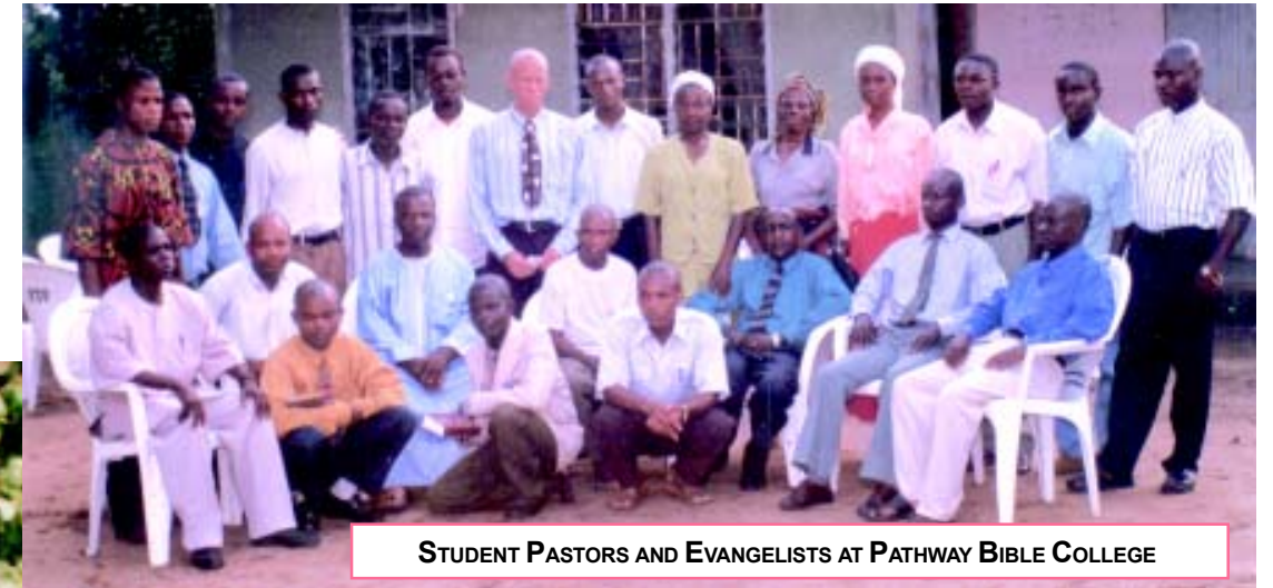
STUDENT PASTORS AND EVANGELISTS AT PATHWAY BIBLE COLLEGE

I was baptized by immersion in water. The Lord spoke when we returned to the church, that one out of 12 baptized, was His leader. At the end of this service, I asked the pastor and elders why should God use a mere man to talk. Because I was then ignorant of the work of the Holy Spirit, these leaders simply gave me a Bible . I attended Bible school, then left for Nigeria for training. Today I am back in Cameroon working with ministers, taking the Gospel across Africa and training new leaders. I preach for 30 minutes on radio every Sunday. More of my work is to take the Gospel into schools, colleges, universities, hospitals, prisons, and villages. My ministry needs your prayers, Bibles , and Bible Pathway devotional guides. The need for these is growing. Even Roman Catholic priests and nuns want the Bible Pathway .