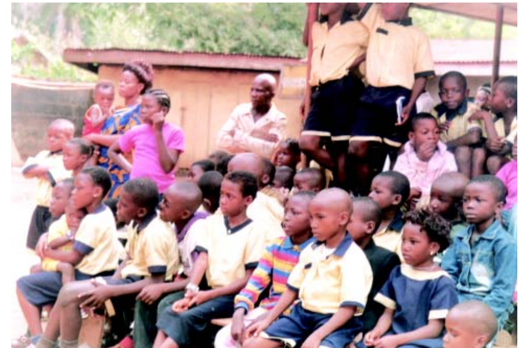
BMCS PRIMARY SCHOOL STUDENTS LISTEN INTENTLY TO BIBLE TEACHINGS OF THE WORD OF GOD.

ETHIOPIA Thank you again and again for sending Bible Pathway . Really, it deepens my relationship with Him. The Lord is helping me to pray more effectively than ever before because the Best of Bible Pathway is igniting the fire in my heart, and my love of reading the Bible .