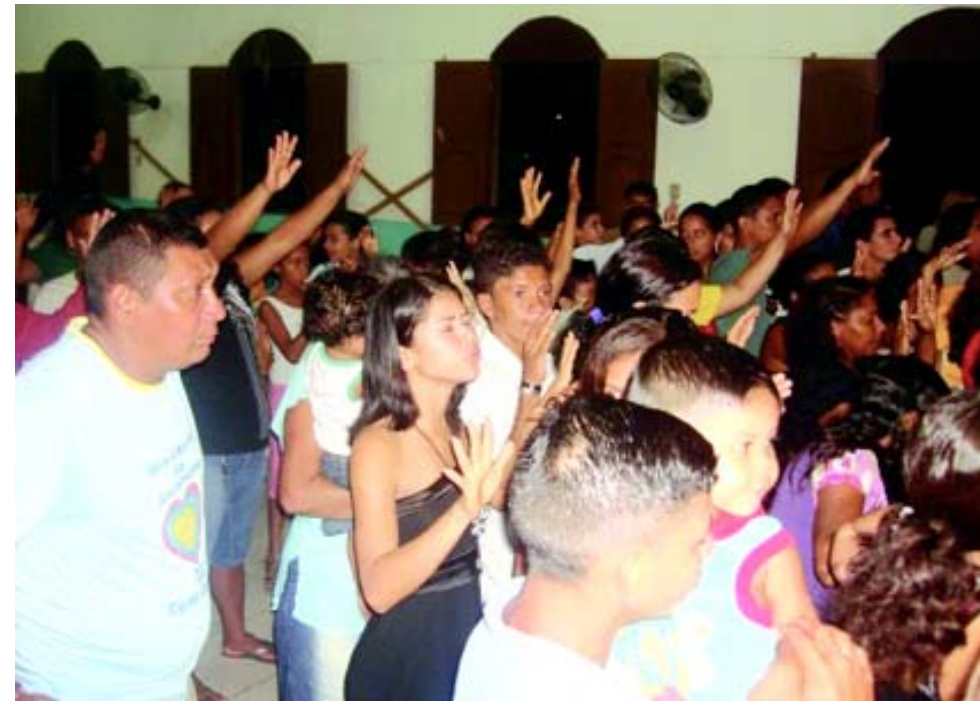
Inside an Amazon River church near Belem, Brazil , hungry souls raise their hands in prayer and praise to our Lord. These worshipers received Spanish Bibles and El Camino Biblicos .

The Bible says: Christ died for the ungodly (Romans 5:6) And to: Go. . . . So those servants went out into the highways, and gathered together all as many as they found (Matthew 22:9-10)