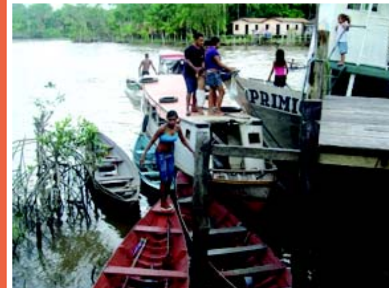
CANOING CHURCHGOERS GATHER TOGETHER TO WORSHIP THE LORD