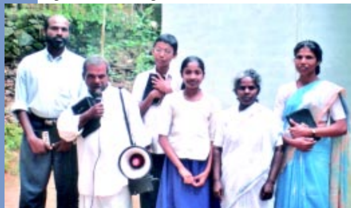
Village ministers arm themselves with Bibles, bullhorn, microphone, and projector to reach colonies with the Word of God

– Pastor K.P., Bible Pathway Church of Voduru, India